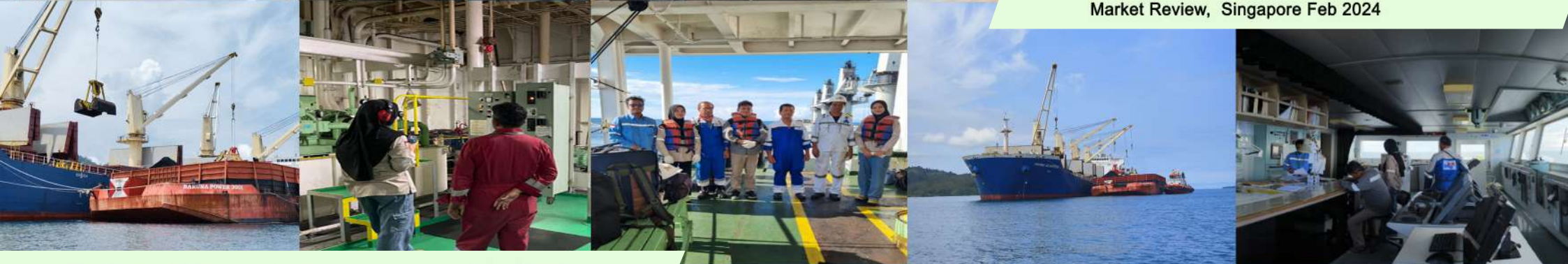
Risk Survey PT Pelayaran Bahtera Adhiguna, March-April 2024