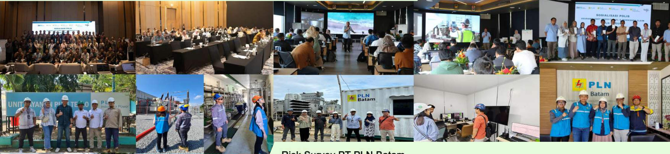
Risk Survey PT PLN Batam