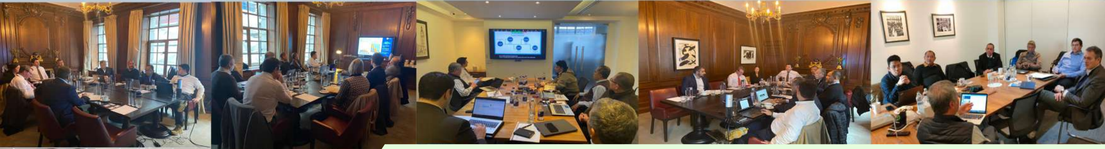
Market Review, London Januari 2024