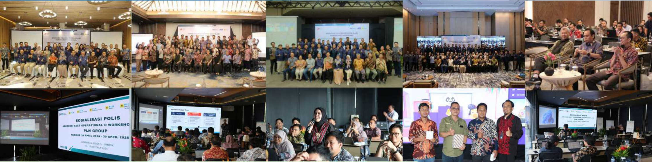
Awareness and Consultation of PT PLN Group Insurance Policy